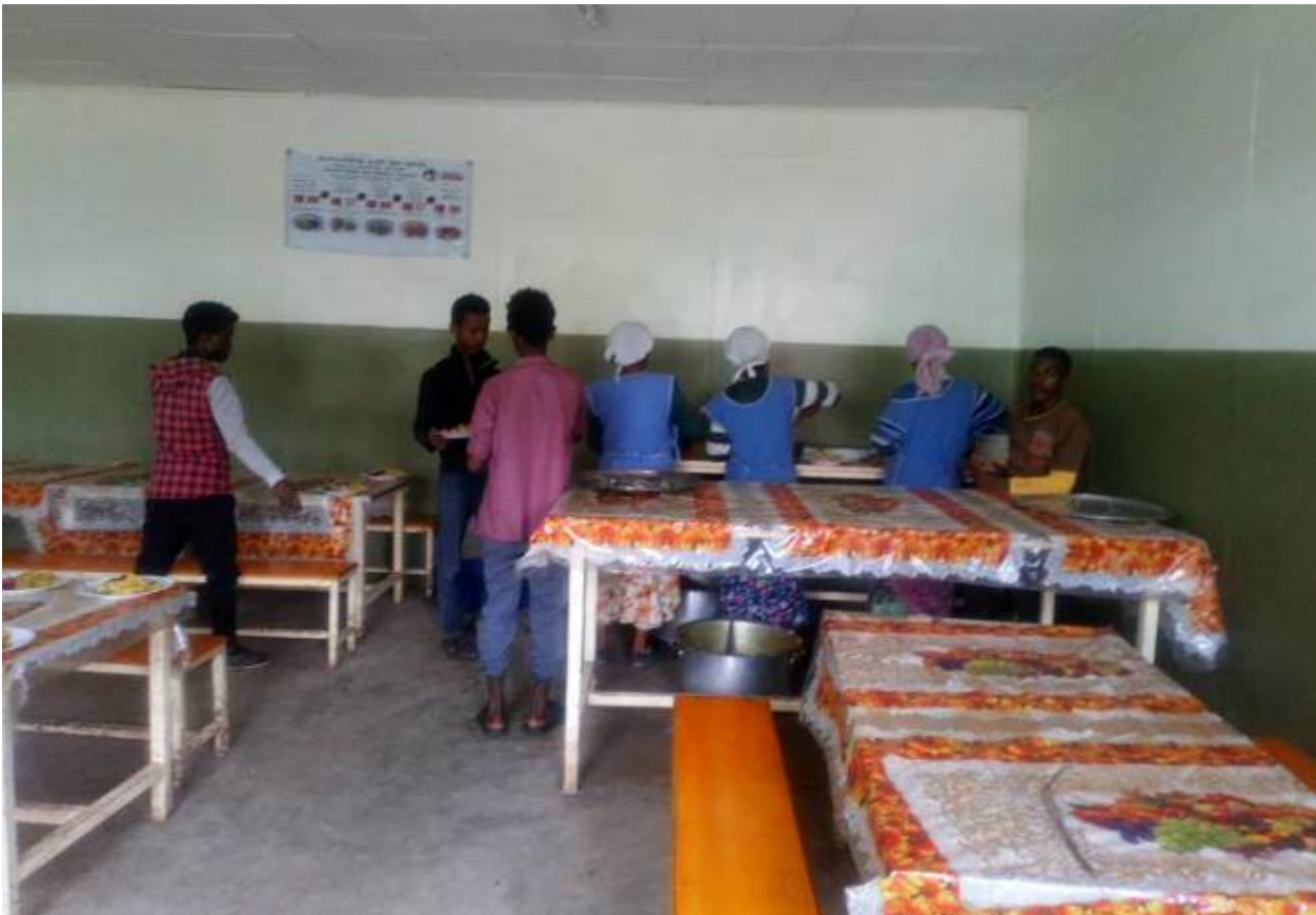
Students helping to setup the dining room for lunch