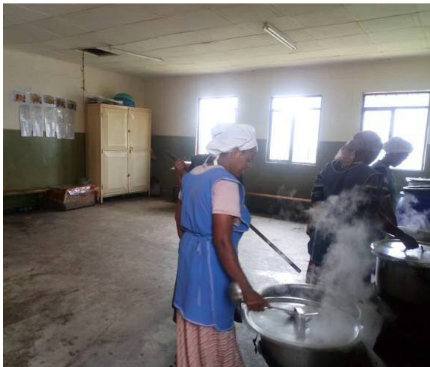
New Kitchen at HPS