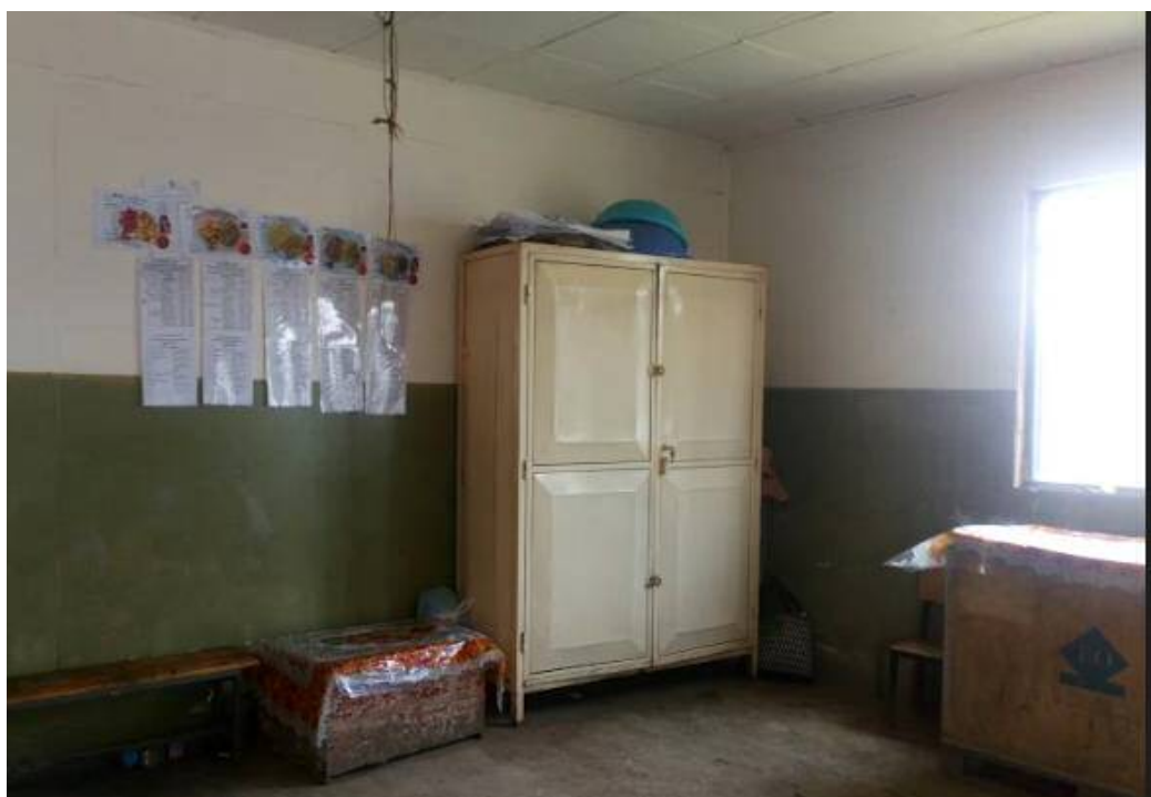
Menu of the weekdays with preparation guideline posted in the kitchen for ease of monitoring