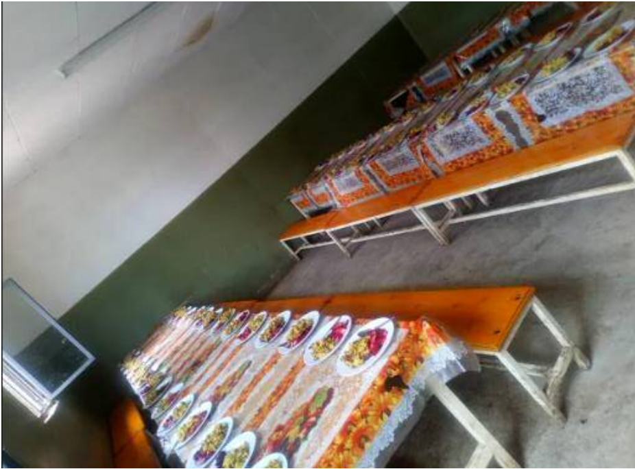
Dining room setup for lunch