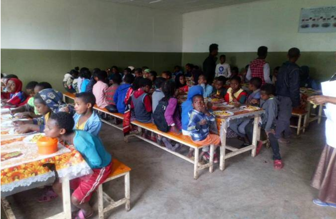
School Children at lunch at Hana Primary School